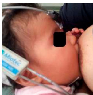
Figure 2. Electromyographic evaluation. Electrodes attached to the bone (forehead) and submandibular (suprahyoid muscles) regions during sucking in breastfeeding.

The mothers received instructions about their positioning, namely, to be seated with their feet on the ground, and about the positioning of the infant, which was to be supported and have the head and the spine aligned straight, with their belly facing the body of the mother and face towards the mother's breast. The infant's mouth was facing the areola and nipple in order to catch the breast. Before the evaluation, the mother received the necessary guidelines on the clinical examination, evaluation of nutritive sucking, and electromyographic examination.